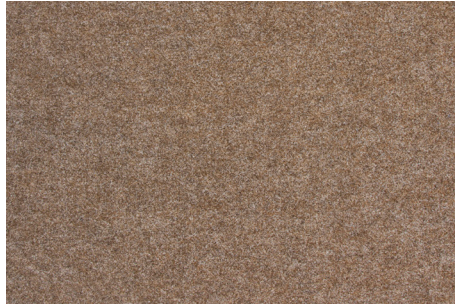
1081 Sepia 2 m - 4 m