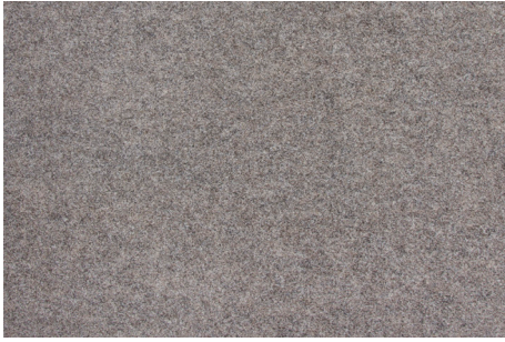
1046 Pebble 2 m - 4 m