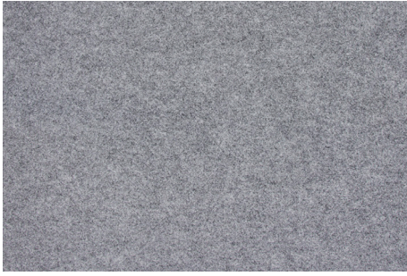
2101 Silver 2 m - 4 m