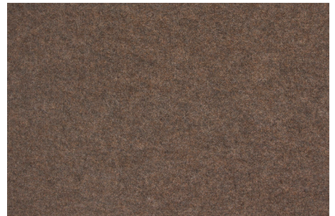
7745 Autumn 2 m - 4 m