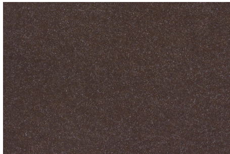
7075 Chocolate 2 m - 4 m