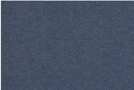
5059 Ultramarine 2 m - 4 m