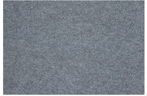
2071 Iron 2 m - 4 m