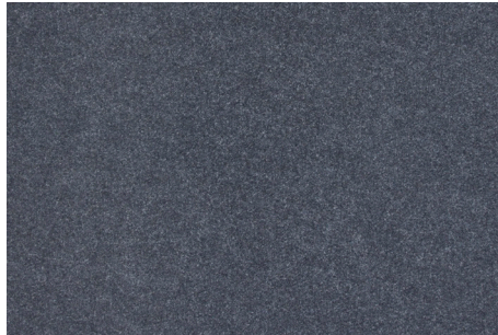
5088 Baltic Blue 2 m - 4 m