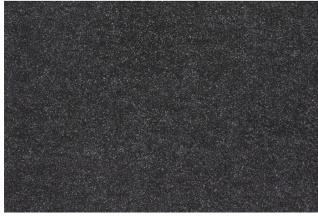
2122 Anthracite 2 m - 4 m