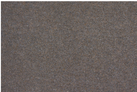
7021 Umber 2 m - 4 m